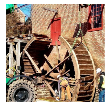
Removing the Wheel