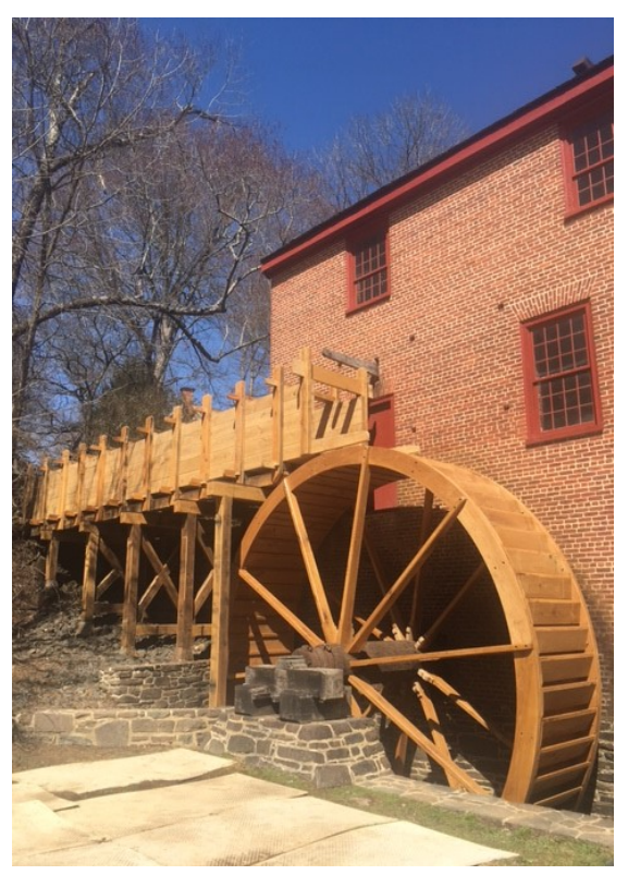
AS OF MARCH 19 WE'RE ALMOST THERE!